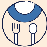
Retail & Hospitality